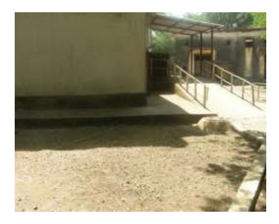
General Store, PTH - After