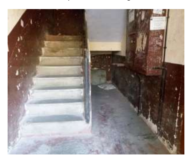
OPD in Hospital Ground Floor