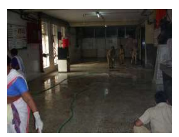
Enquiry Counter – Before Washing