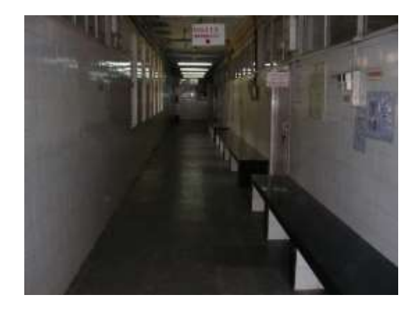
OPD Passage, PTH – After Washing