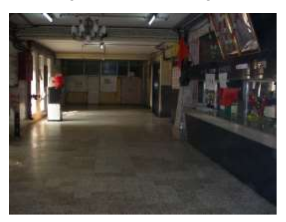
Enquiry Counter – After Washing