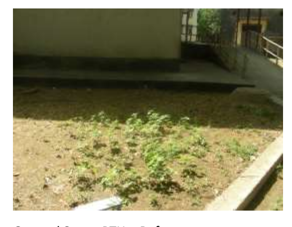
General Store, PTH – Before