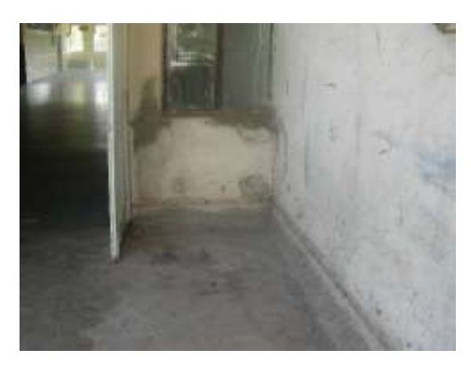
2<sup>nd</sup> Floor Near Terrace - After