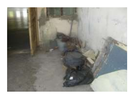
2<sup>nd</sup> Floor Near Terrace – Before